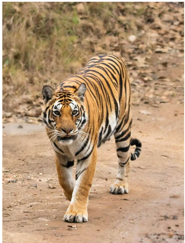
Image taken at Bandhaogarh Nation Scantuary

This is India, unplugged. This is the heart of the heritage. This is your Grand Central Odyssey.